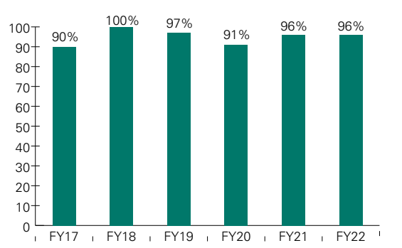
FIAS CLIENT SATISFACTION, FY17–22 Share of positive client responses from FIAS supported projects